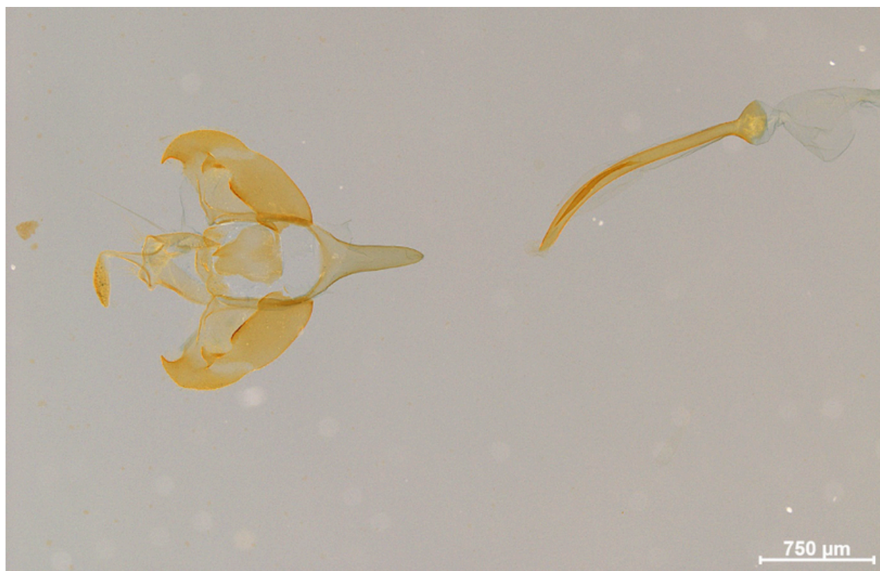
Fig. 2. Depressaria discipunctella Herrich-Schäffer, 1854. Male genitalia, São Romão, São Brás de Alportel, Algarve, 19.vi.1976, leg. J. Passos de Carvalho. M. Corley gen. prep. JPC 98-14.